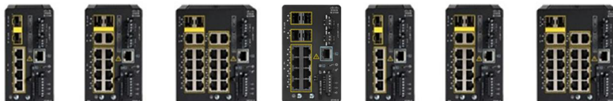
Figure 1. IE-3100 Rugged Series switches models