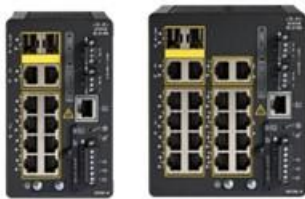
Figure 2. IE-3105 Rugged Series switch models with enhanced feature set